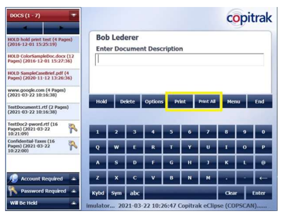
From any of the copiers, you can select which jobs to print (release) or release all your jobs in the queue.

Options to directly print the document, securely store, password protect, batch print, or add a description to the document.